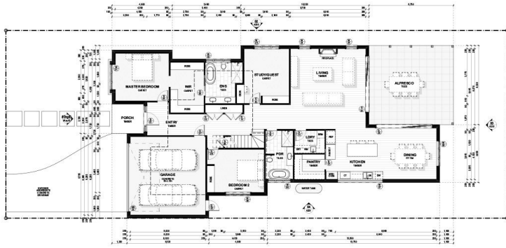
01 GROUND FLOOR PLAN 1:100

REV DESCRIPTION DATE PROJECT DRAWING DETAILS DRAWING # REV A ISSUED FOR PERMIT 2018 New Double Storey Residence Project Name by Pinnacle Builders GROUND FLOOR PLAN 1:100 (G.A.) Arch: ANTHONY@PINNACLE.COM.AU DATE: August 2018 PROJECT # 1807 A100 A